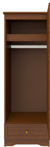
Model: LAWR11R 25W 23.75D 71H

The Lancaster Collection offers unobtrusive refinement and skilled craftsmanship to form the perfect balance between function and beauty. Rich OG detailing on the tops and recessed insert panels set into chamfered frames on doors and drawers. Collection available with or without contrasting edges as well as custom color combinations.